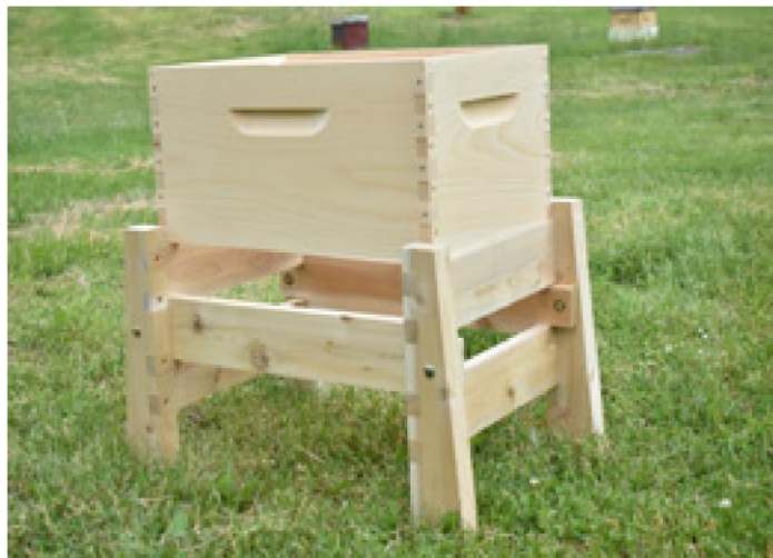
Completed stand pictured with hive box

Step 3: Thread the bolts through the pre-drilled holes on outside of leg assemblies and the side rails (See fig. 3). Slide on the washer and nut on the other side and tighten with a socket wrench. Repeat on all four corners.